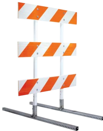
T3B Plastic Type III Barricade