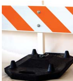
Yeti 40 lb. rubber foot

The T3B polycomb panel is the heart of our crashworthy system. Constructed of only the best quality polymers, the 8 1/4 wide, UV-stabilized panels have proven durability. During normal use, our panels will not fade, crack, or splinter. Featuring a 9-leg honeycomb structure, the pre-colored white panels are very flat in order to make striping with a standard tape